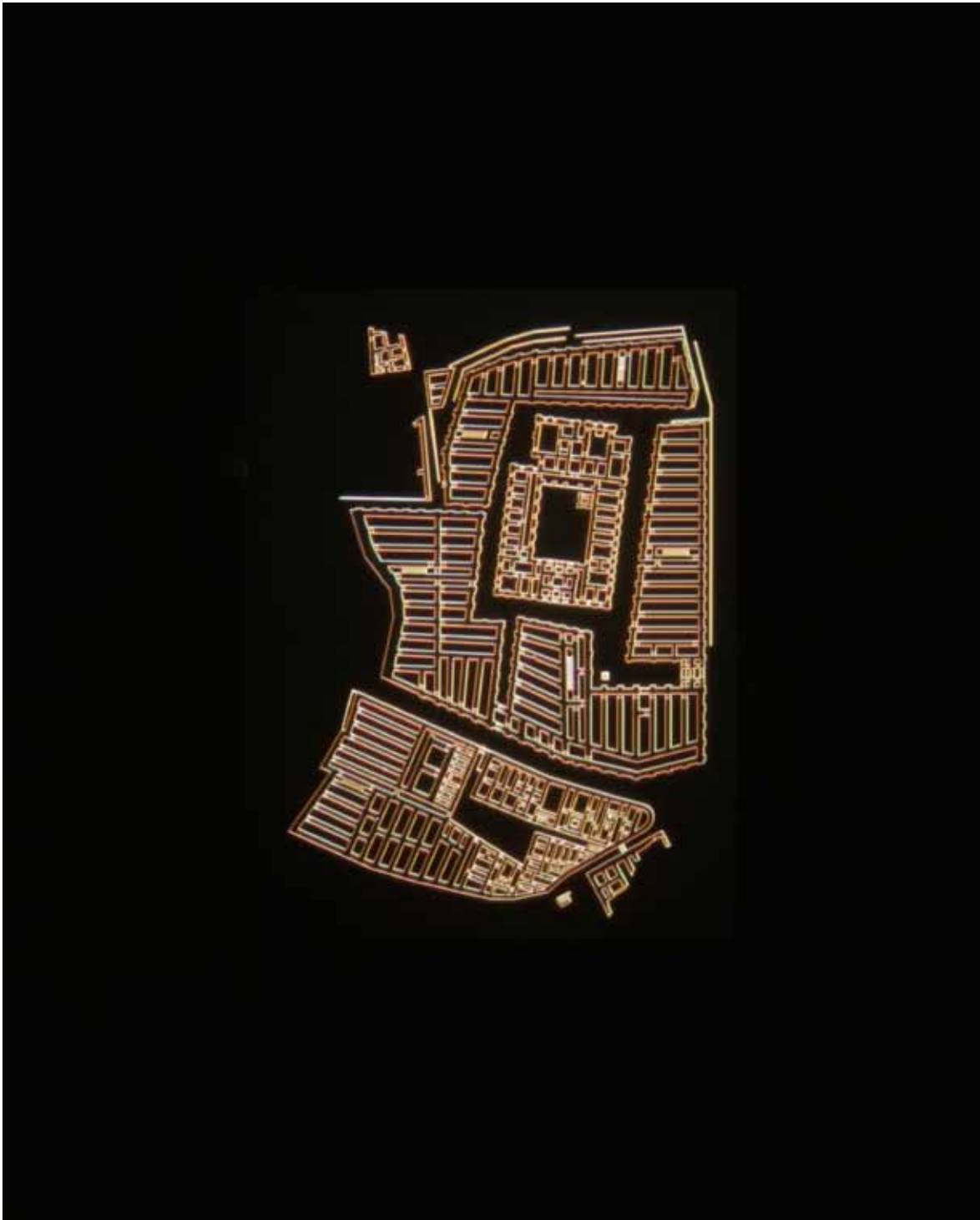
Michel Paysant , Hattusha, Grand Temple

Nano production using electron beam lithography, gold on silicon, 187 \mu\text{m} x 261 \mu\text{m}