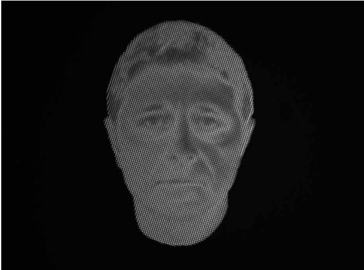
Michel Paysant , Autoportrait de l'artiste (détail)

Nano production using electron beam lithography, gold on silicon, 122 \mu\text{m} x 180 \mu\text{m}