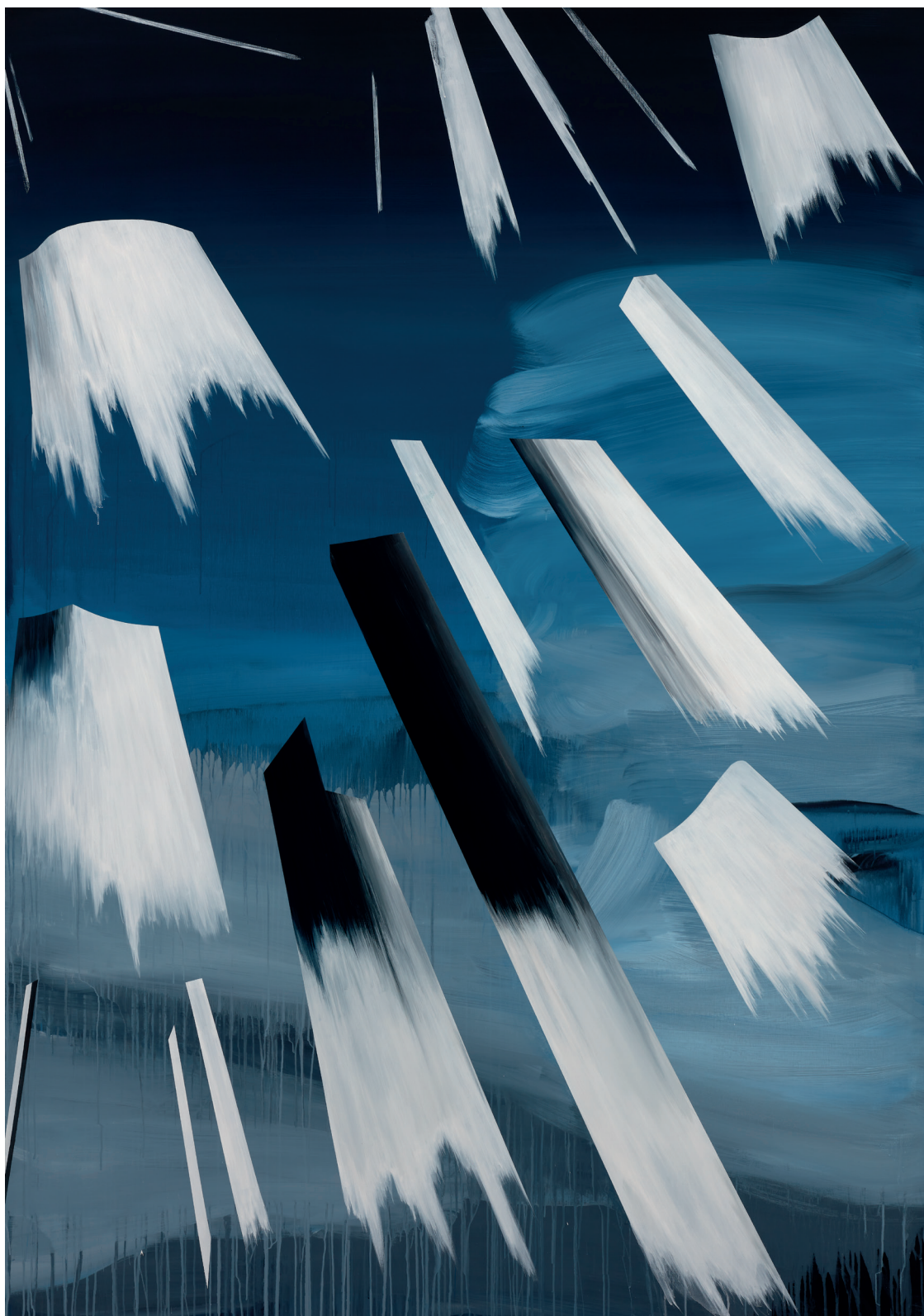
Arctic Forecast II , 2021 Acrylic on canvas 270 x 190 cm Photo: We Document Art ©Tina Gillen / Courtesy of the artist