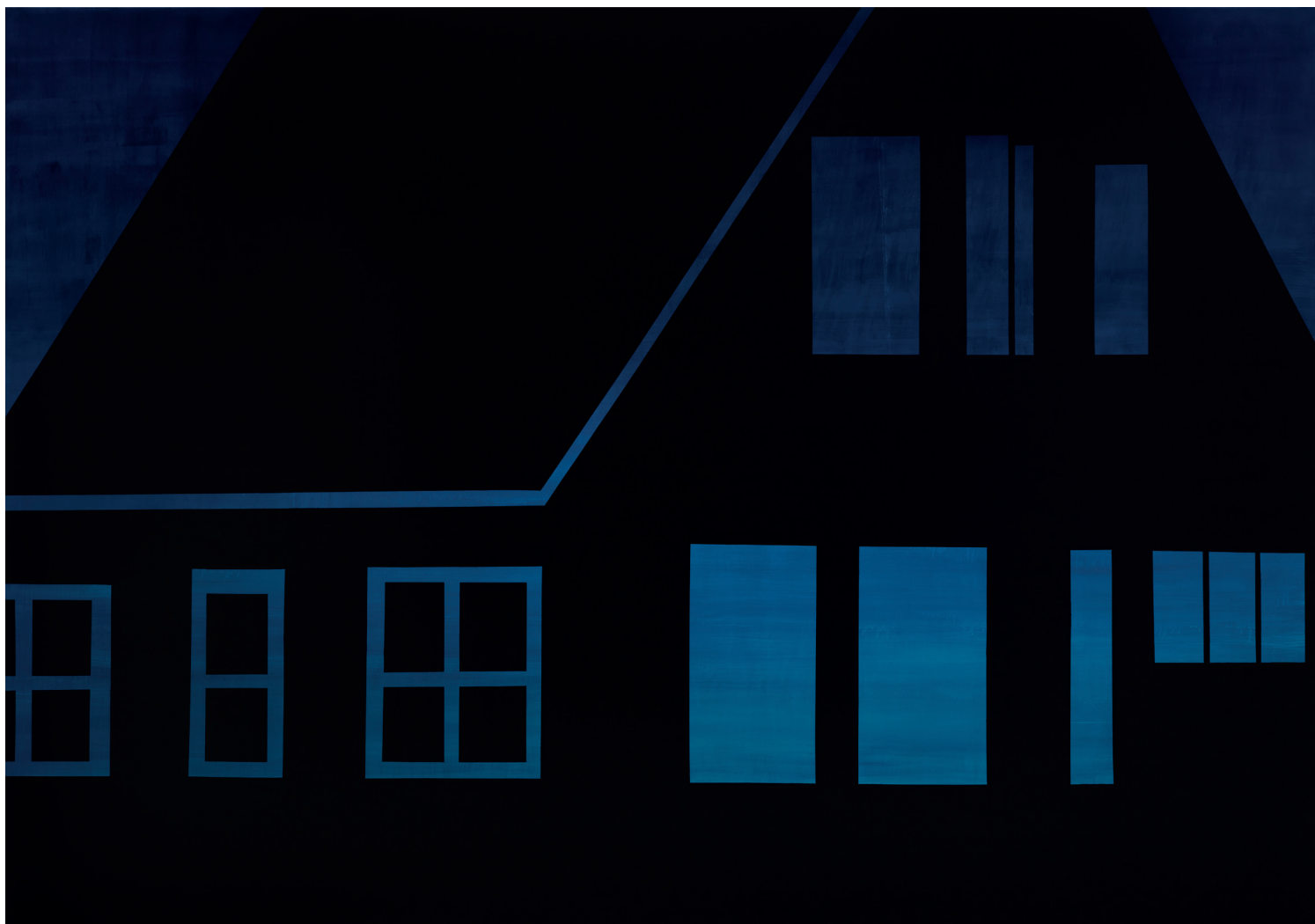
Sealevel V , 2022 Acrylic on canvas 350 x 500 cm Photo: We Document Art ©Tina Gillen ©Tina Gillen / Courtesy of the artist