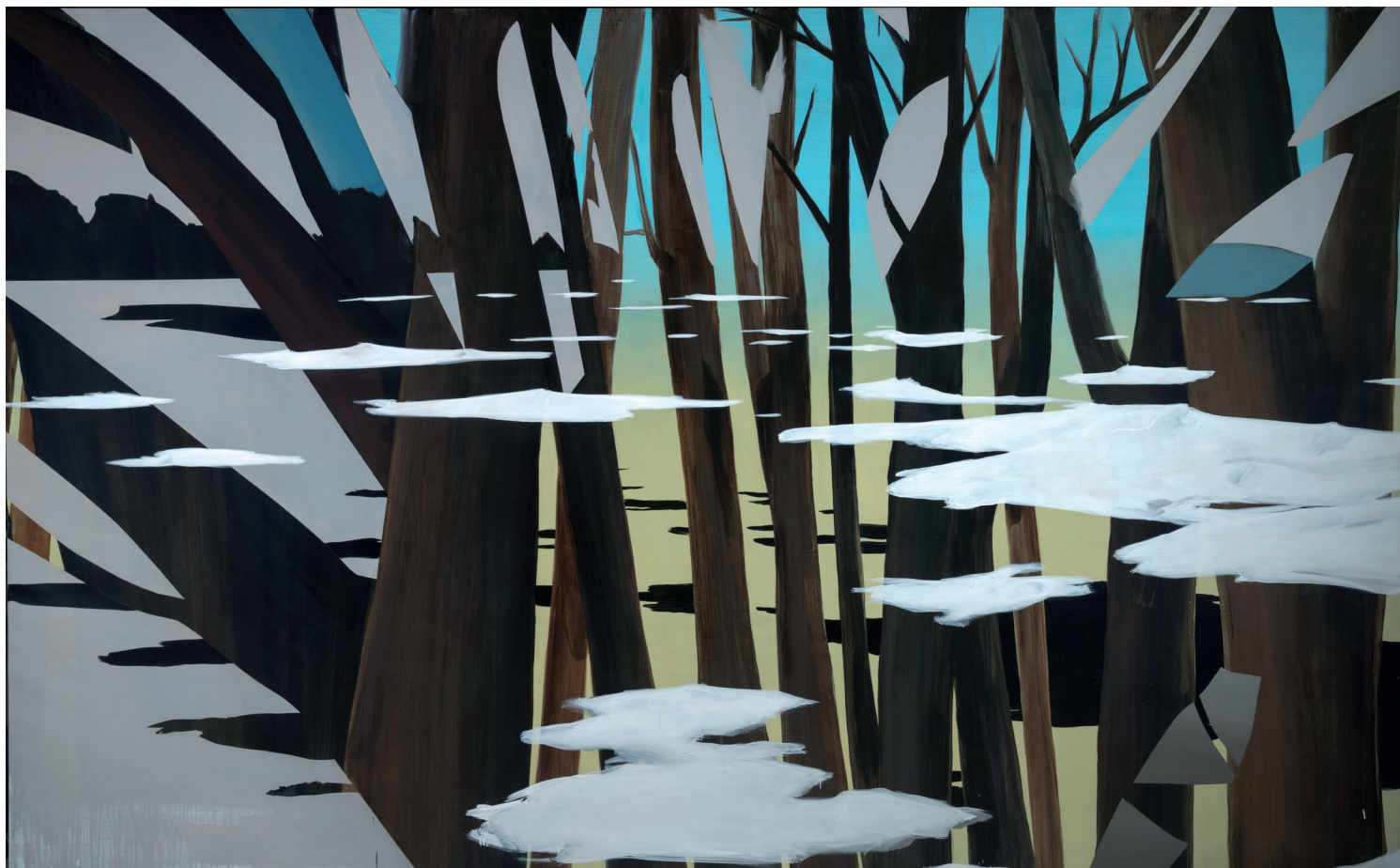
Sealevel IV , 2022 Acrylic on canvas 270 x 440 cm Photo: Florian Kleinfenn ©Tina Gillen / Courtesy of the artist