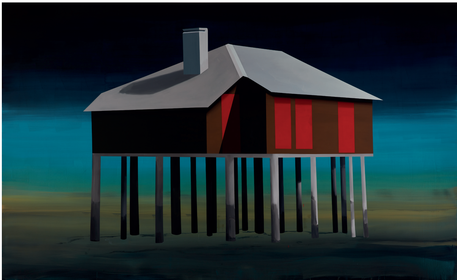
Sealevel VI , 2022 Acrylic on canvas 295 x 480 cm Photo: We Document Art ©Tina Gillen ©Tina Gillen / Courtesy of the artist