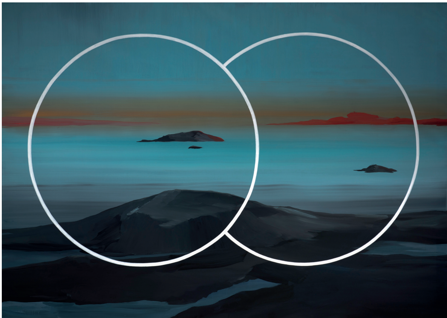
Time Travel II, 2022 Acrylic on canvas 270 x 380 cm Photo: Florian Kleinfenn ©Tina Gillen / Courtesy of the artist